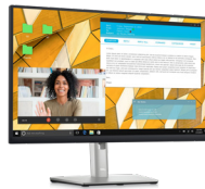
Dell 24 Monitor - P2423D

Take your work to new heights with this 23.8-inch FHD monitor with a wide color coverage. Features ComfortView Plus an always-on built-in low blue light screen, fast connectivity and transfer speeds.