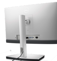
OptiPlex Premier 24 All-in-One Height Adjustable with Flex Bay (ODD Drive) Stand

Raise, tilt, pivot or swivel your All-In-One Plus to enjoy the best view.