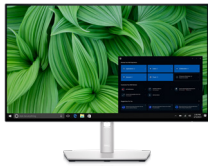
Dell UltraSharp 24 Monitor – U2422H

Take your work to new heights with this 23.8-inch FHD monitor with a wide color coverage. Features ComfortView Plus an always-on built-in low blue light screen, fast connectivity and transfer speeds.