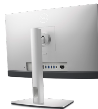
OptiPlex Premier 24 All-in-One Height Adjustable Stand

With the ability to tilt and raise your monitor to the optimal viewing level, you can ensure that your workspace is as comfortable as possible.