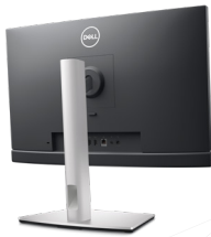
OptiPlex Entry 24 All-in-One Height Adjustable Stand

With the ability to tilt and raise your monitor to the optimal viewing level, you can ensure that your workspace is as comfortable as possible.